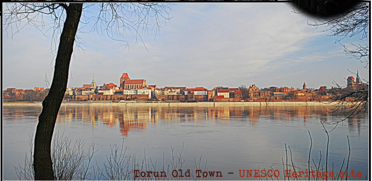
Torun Old Town - UNESCO Heritage site